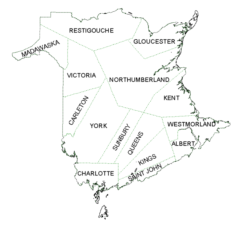
Figure 1. New Brunswick counties.

prior to moth eclosion in the local areas and retrieved in late August – October, well after moth flight period had ended. Moths caught in each trap were counted, placed in appropriately labeled envelopes, and frozen for subsequent examination. Geo-referenced coordinates were recorded for each location and this facilitated assigning locations to counties within the Province (Fig. 1). Changes in overall Provincial moth densities in DNRE annual surveys are summarized Table 1.